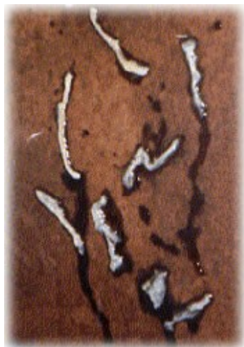
Photograph of worms killed in the first few minutes of zapping during a colonic irrigation treatment

The US Center for Disease Control (CDC) has found that the average American carries a weight of 500g living parasites. Toxins in our food, household chemicals and the environment are weakening the barrier of the colon against penetration by intestinal worms and other parasites.