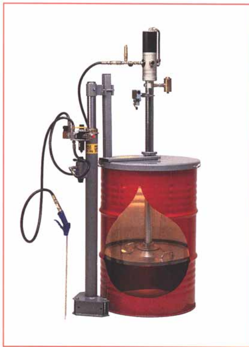
SVM 92 Series