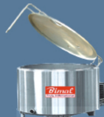
CIRCULAR VERTICAL TANK 500 and 1000 litre